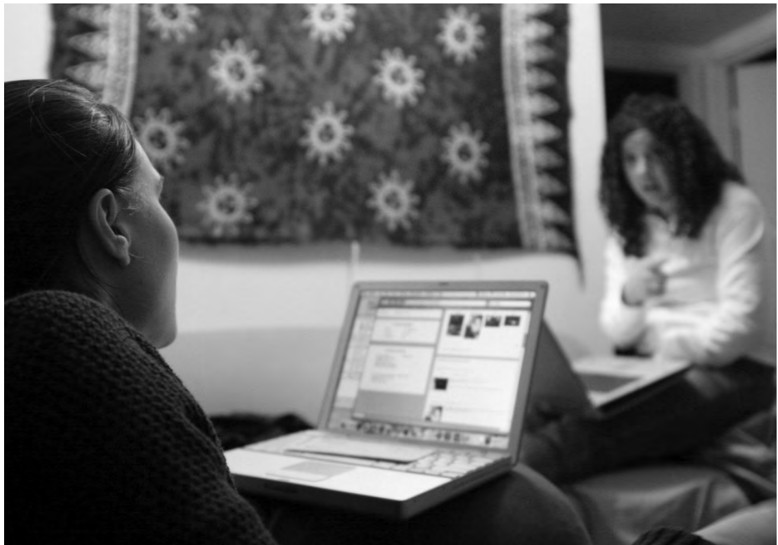
Figure 1: Teens socializing online and offline ("MySpacing")